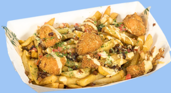
chicken smash fries